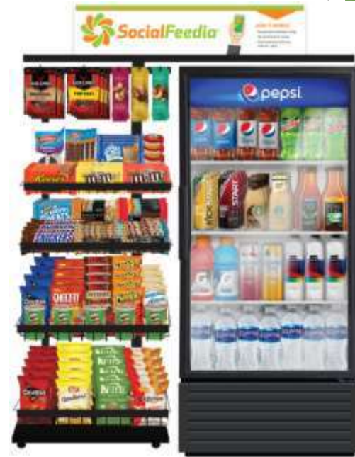
Freestanding Floor Display